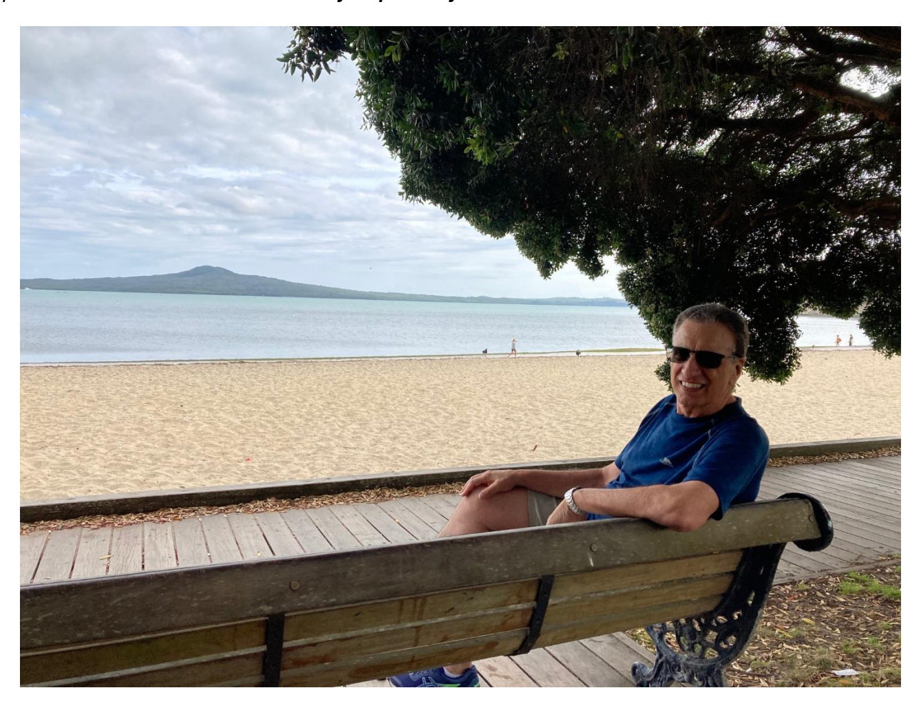
Saint Heliers Beach, Auckland

We hope that you will take a few minutes to read what has been happening in our ministry recently. The Perspectives section reveals that it's time for spiritual fathers and mothers to arise.