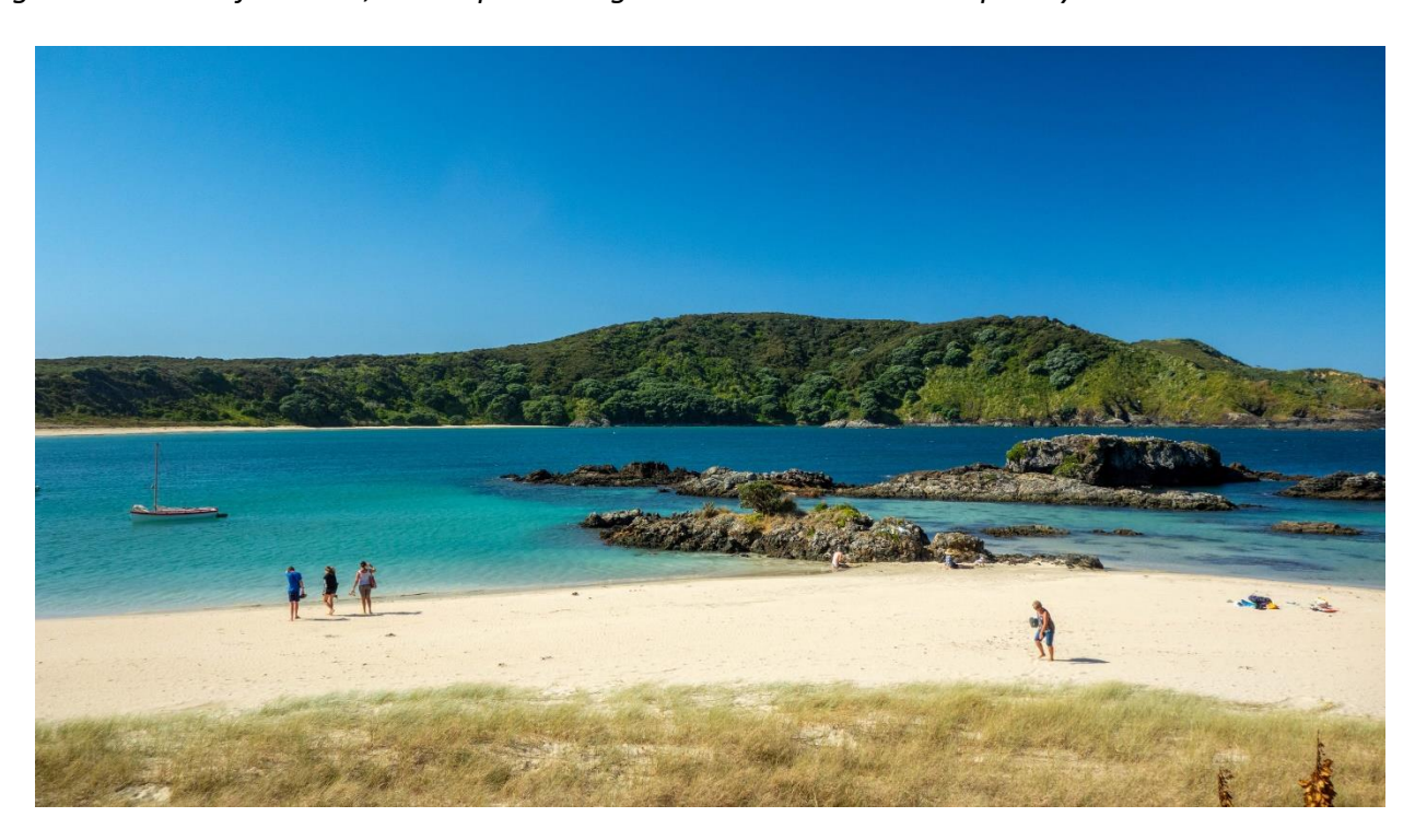
Doubtless Bay, Northland

"I attended the New Zealand and Beyond conference a few years ago in Auckland. Due to blood clots, I had suffered severe pain in my right leg for around two years. You called people to come out of their seats for prayer. I didn't want to move, but reluctantly began to make my way past others in my row to get to the aisle. By the time I got to the end of the row, all the pain had gone and I have been completely healed ever since!"