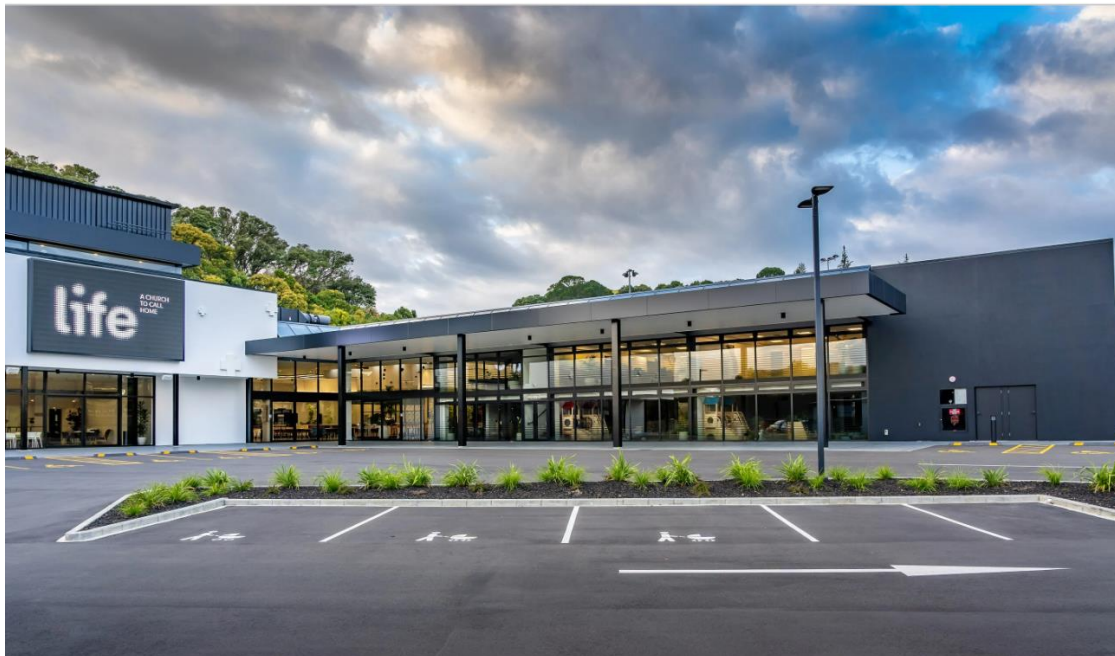
Life Central, Auckland