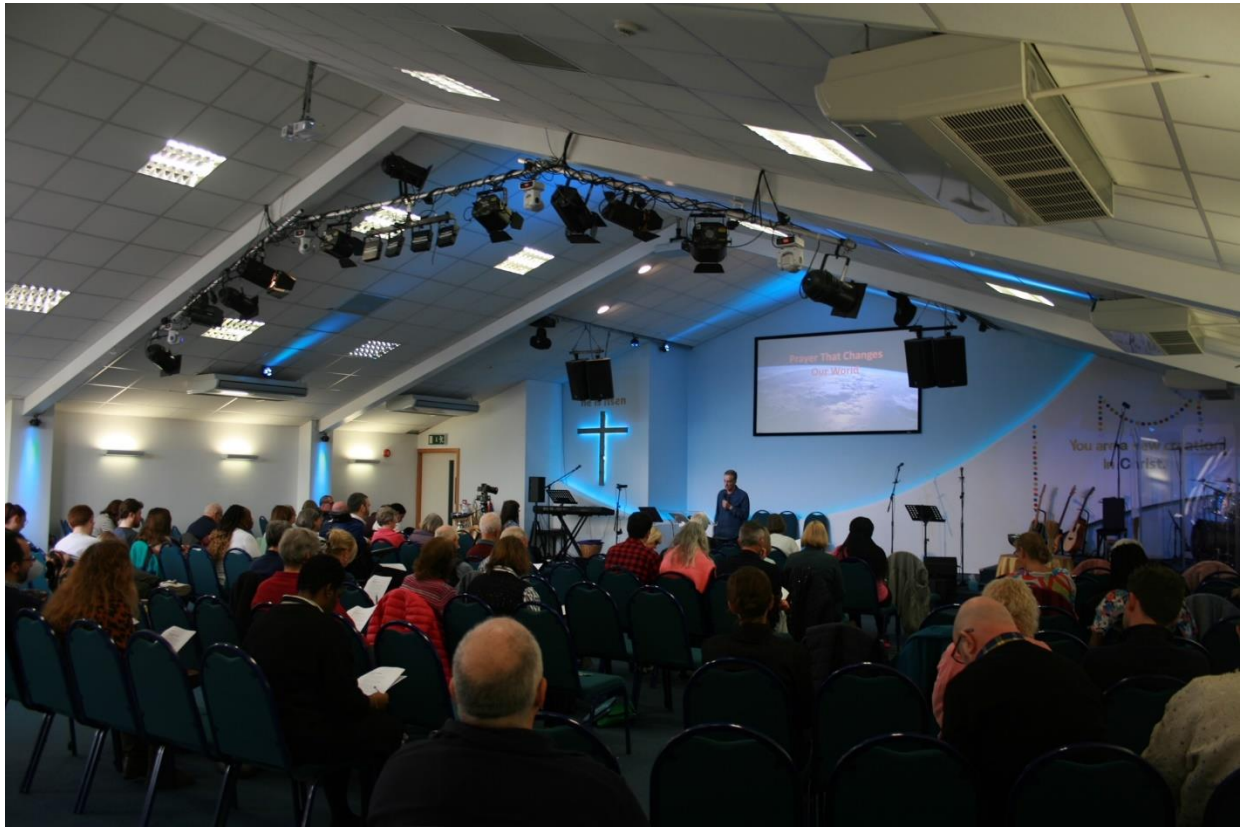
Seminar at Gateway Church, Yate, England